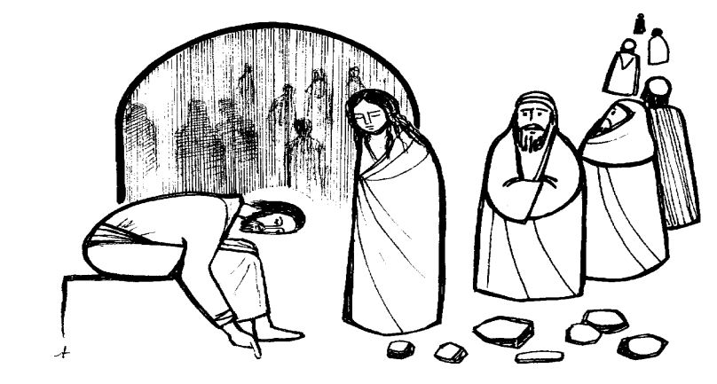
Responsorial Psalm What great deeds the Lord worked for us! Indeed, we were glad.

A woman who has been caught in the act of committing a serious sin is not condemned by Jesus. Instead, she is told to go and sin no more.